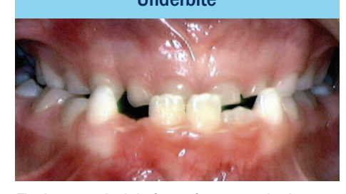
The lower teeth sit in front of upper teeth when back teeth are closed